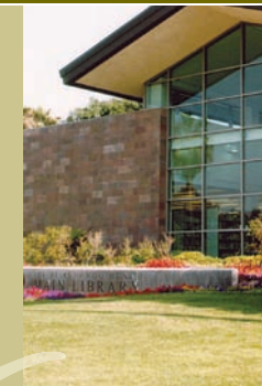
City of Redondo Beach Main Library