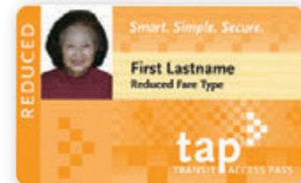
TAP CARD, REDUCED Only Stored Value or Commuter Express pass (NO Metro passes accepted)