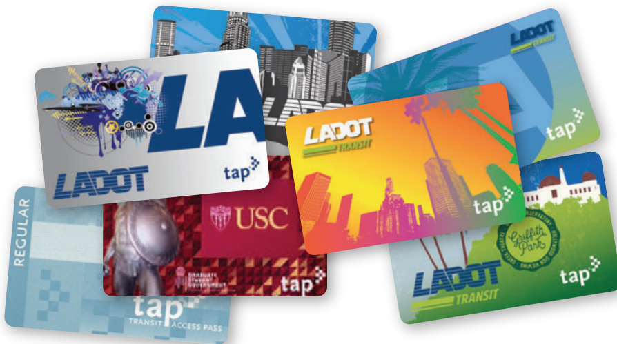
TAP CARD DESIGNS MAY VARY